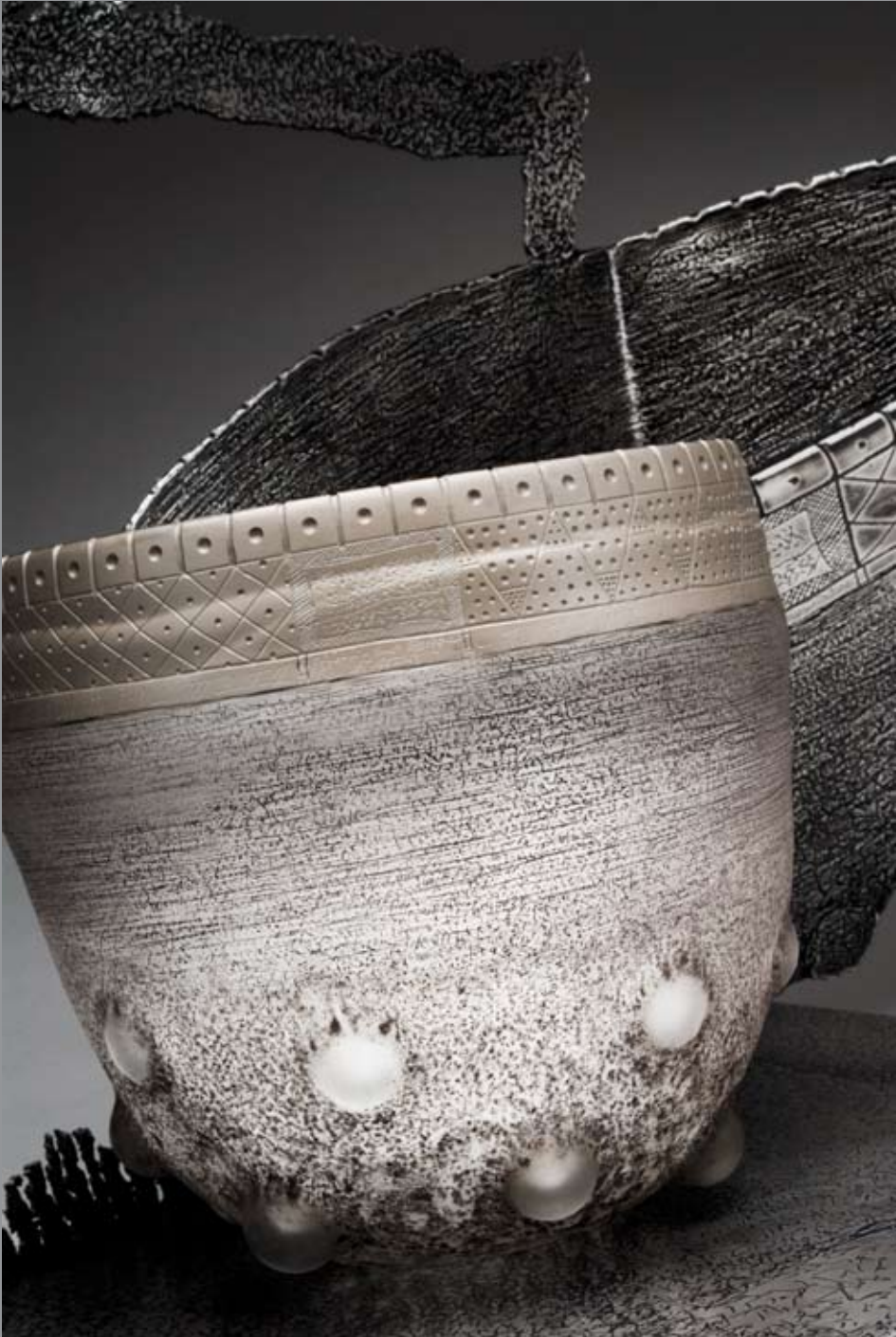
Offering Bowl Sculpture (detail) 2009

engraved glass and stainless steel, platinum and enamel 105 x 60 x 50 cm