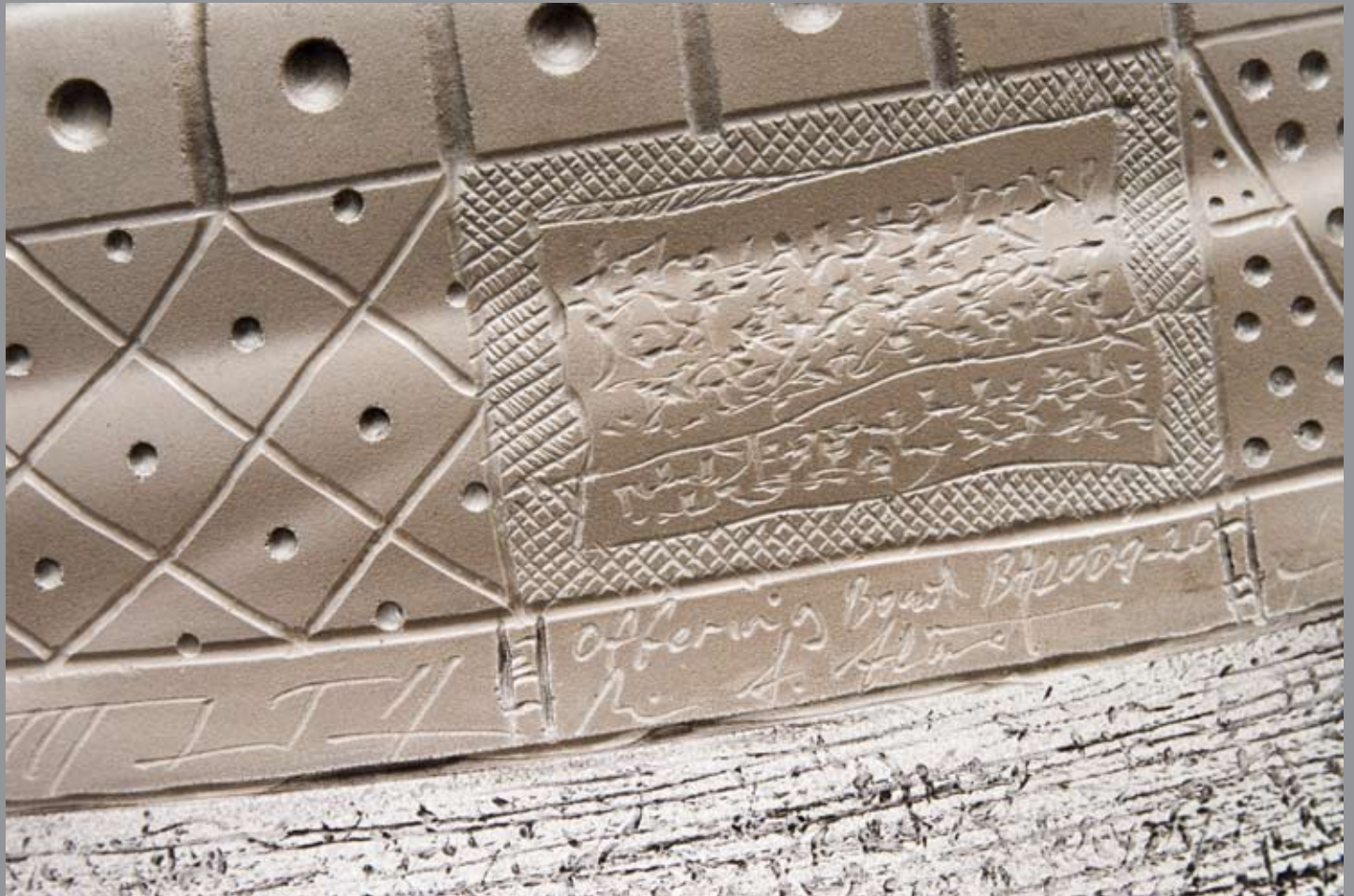
Offering Bowl Sculpture (detail) 2009

engraved glass and stainless steel, platinum and enamel 105 x 60 x 50 cm