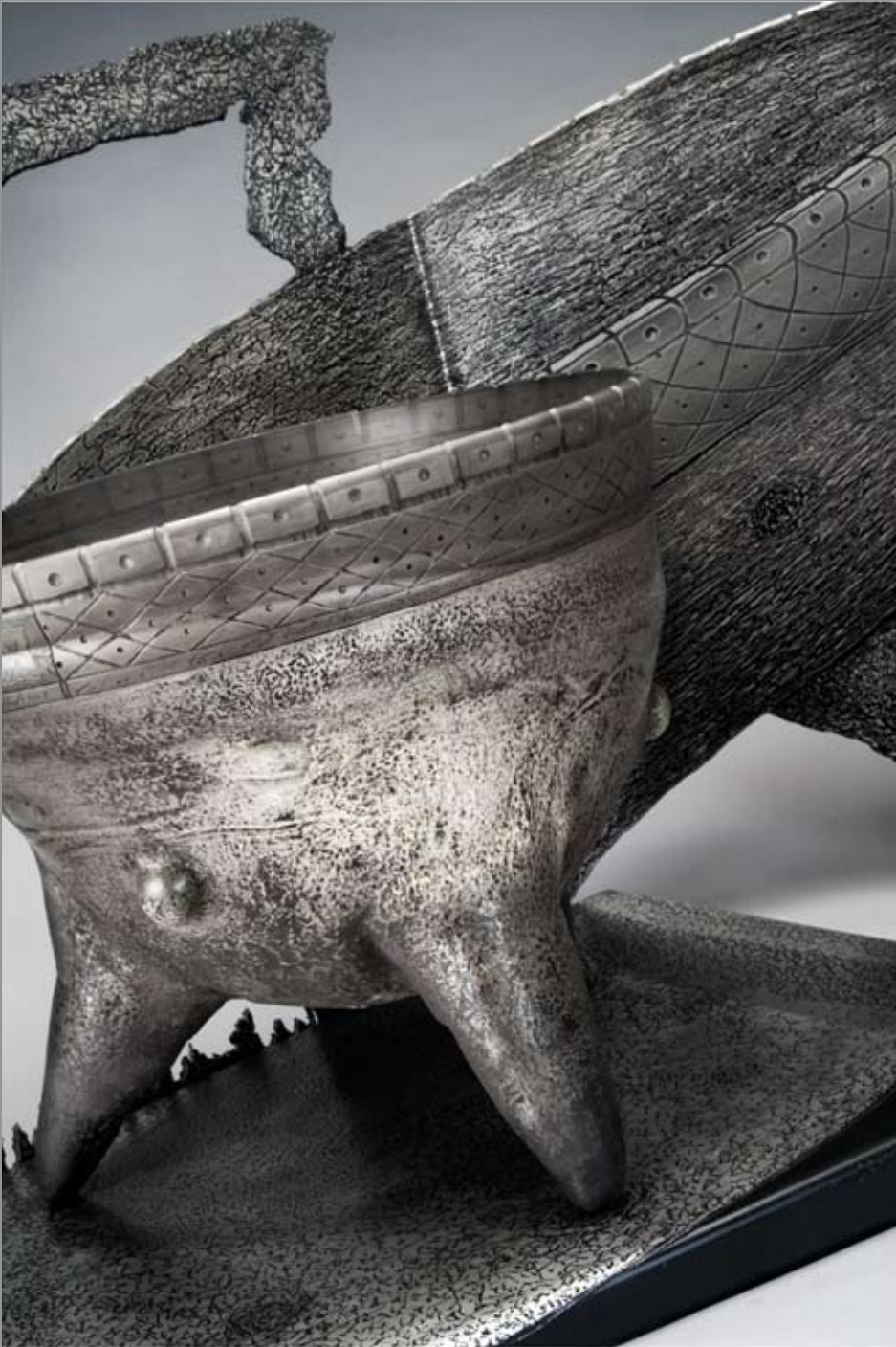
Votive Bowl Sculpture (detail) 2009

blown/cast glass, engraved glass & stainless steel, platinum & enamel 60 x 106 x 50 cm