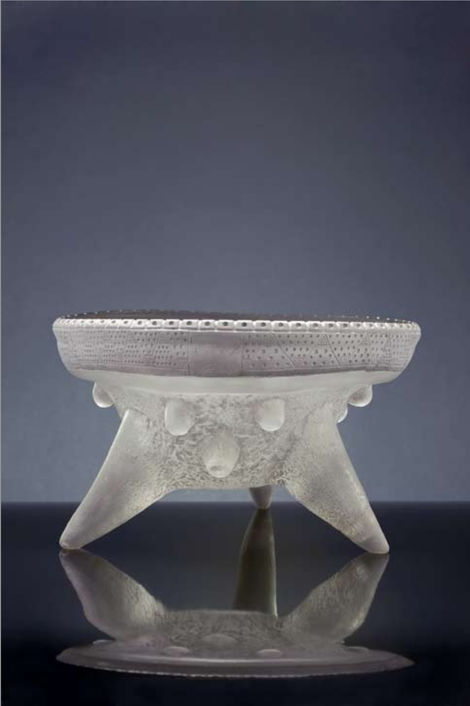
Platinum Votive Bowl 2009

blown/cast glass, engraved platinum 26 x 41 x 40 cm