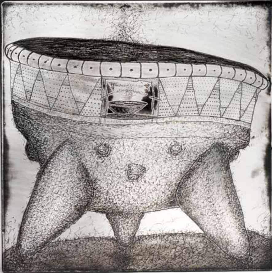
Votive Bowl Panel 2009