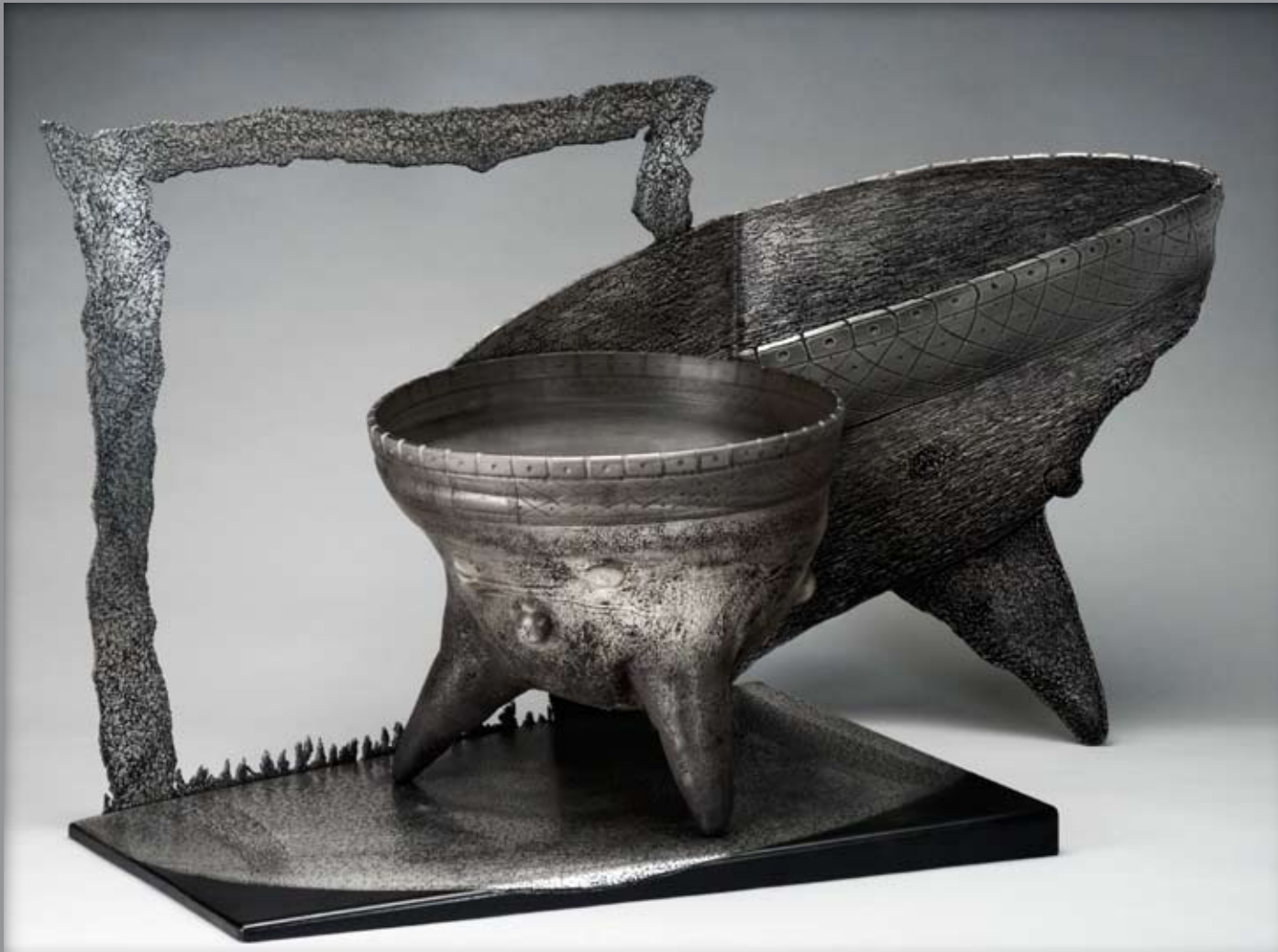
Votive Bowl Sculpture 2009

blown/cast glass, engraved glass & stainless steel, platinum & enamel 60 x 106 x 50 cm