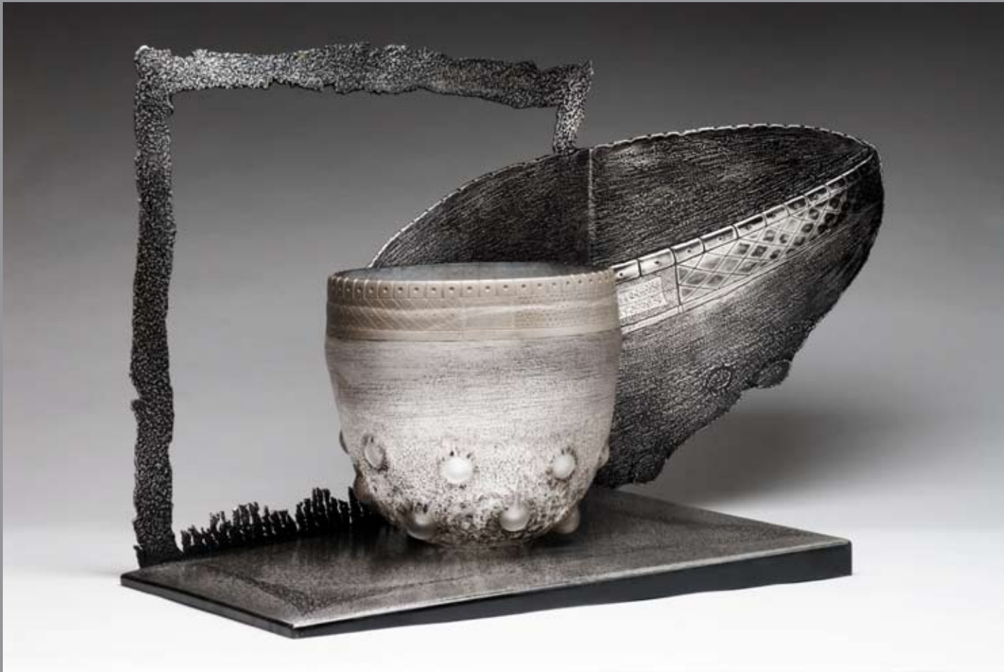
Offering Bowl Sculpture 2009

engraved glass and stainless steel, platinum and enamel 105 x 60 x 50 cm