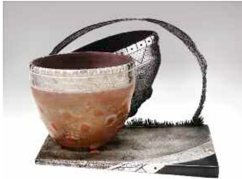
'Shadow Offering Bowl', 2007, engraved glass and stainless steel, 50 x 59 x 51 cm

black enamel instead of the printing ink. In the current work I can see a strong visual link with Hirst's underlying interest in drawing and printmaking and the use of glass as a medium to express ideas.