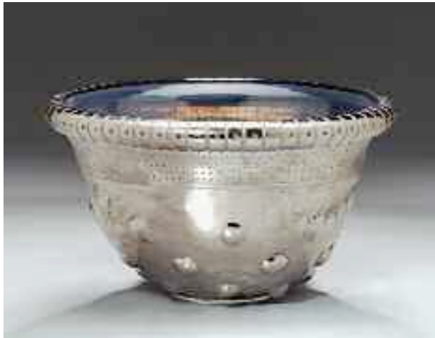
'Offering Bowl 3', 2002, engraved glass, platinum, 29 x 40 x 40 cm