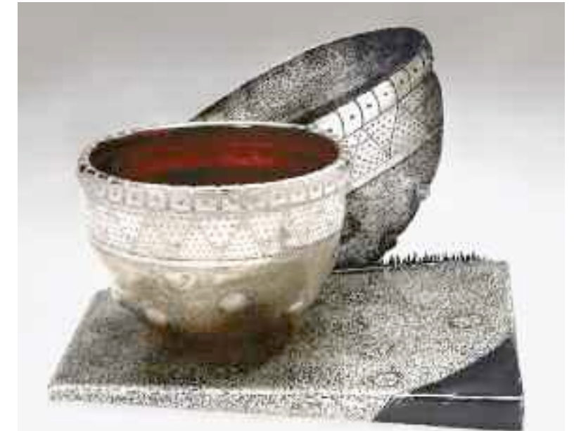
'Shadow Offering Bowl', 2007, engraved glass and stainless steel, 38 x 59 x 51 cm

the Novy Bor Symposium in the Czech Republic as a visiting artist. It was here that he first experimented with carving and engraving a "portrait" of the blown vessel on sheet glass and pairing it with a blown vessel. This experiment, in which both object and image were made of glass, proved hugely successful. In 1994, Votive Bowl 1/94 , a work from his Object and Image series, won the prestigious Grand Prize at the "World Glass Now '94" exhibition at the Hokkaido Museum of Modern