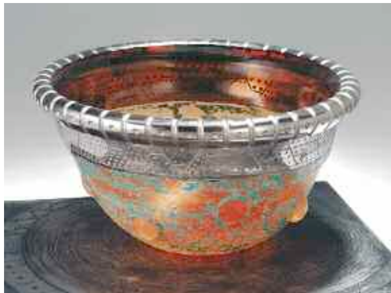
'Offering Bowl 2', 2005, blown/cast glass, engraved, platinum, 20 x 40 x 40 cm

There is also a theatrical element to Hirst's work, with the engraved panels providing a "stage" for the vessels and a place for dialogue between the vessel, its portrait, and its shadows. The metal base or "stage" emphasises the three-dimensionality and textural qualities of the vessel. At the same time, it reminds us that the vessel is an object that has been made: "drawn" and made in glass and precious metal.