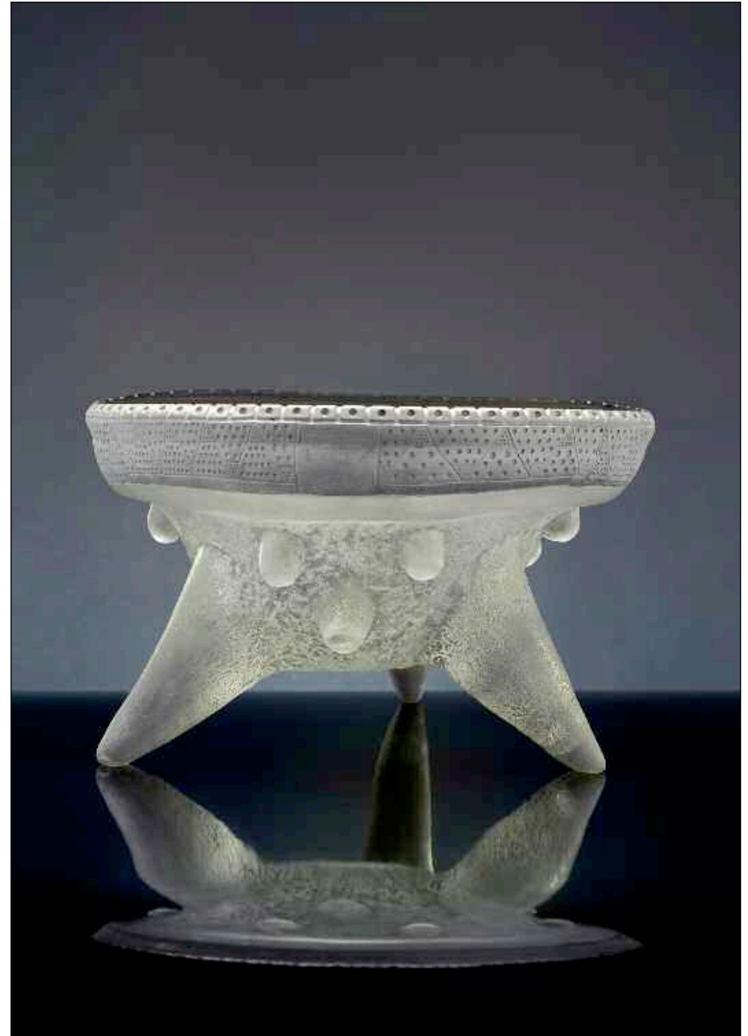
'Platinum Offering Bowl', 2009, blown/cast glass, engraved, platinum, 26 x 41 x 43 cm