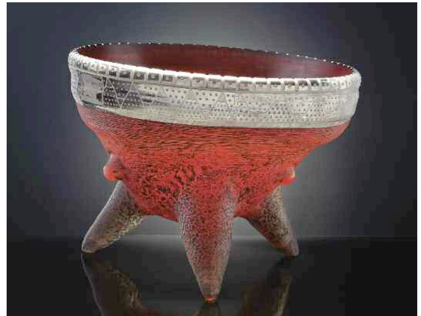
'Scarlet Votive Bowl', 2009, bowl/cast glass, engraved, enamel and platinum, 32 x 42 x 42 cm

The ideas employed by Hirst to make the vessels have changed, becoming more confident and assured. Most recently, he has chosen to use stainless steel as the material for his vessel images and is engraving both the surface of the vessels and the stainless steel shadow. His colour palette is also moving closer to that of metal, with the surfaces of the vessels coated with a platinum and