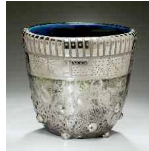
'Offering Bowl', 2002, engraved glass, platinum, 40 x 36 x 36 cm

A turning point came in 1991 when Hirst took part in