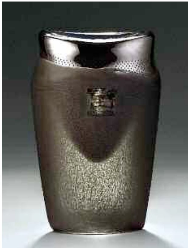
'Platinum Guardian', 2002, blown/cast glass, engraved, platinum, 39 x 26 x 16 cm

glass vessels and engraved panels are more closely aligned to drawing and sculpture. This is reflected in the scale, strength and complexity of the vessel forms. As Nola Anderson wrote in 1987, when Hirst was just 30 years old, his work falls in the space described by Rauschenberg as 'the gap between art and life'. For Hirst, this means creating a contemporary language of his own that references, but does not imitate, the past and reflects his individual values and interests. For him, these interests are broadly cultural and encompass objects that mark rites of passage and those used in the rituals of daily life.