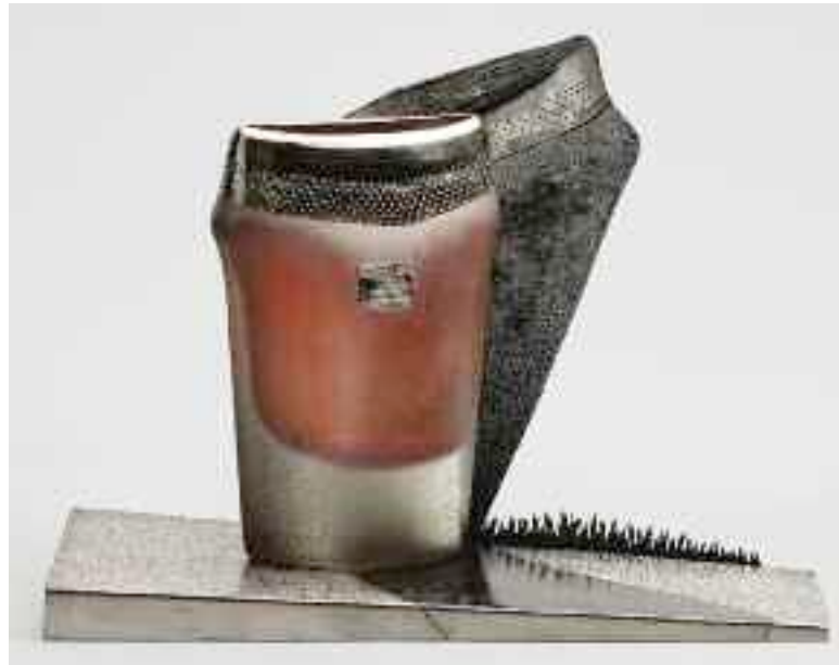
'Shadow Guardian', 2007, engraved glass and stainless steel, 56 x 70 x 35 cm