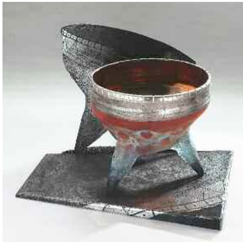
'Shadow Votive Bowl', 2004, blown/cast glass, engraved, stainless steel, enamels, 49 x 69 x 65 cm. National Gallery of Australia