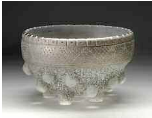
'Platinum Offering Bowl', 2008, engraved glass, 15 x 25 x 25 cm