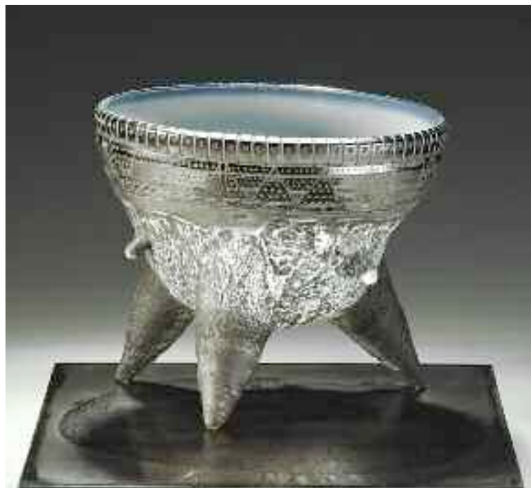
'Votive Bowl & Shadow', 2002, engraved glass and platinum, 30 x 38 x 36 cm